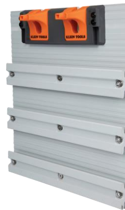
Storage Wall Assembly (Cat. No. BC99WA) Wall Assembly, S-Hook (Cat. No. BC100S)