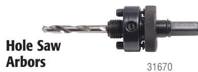
Hole Saw Arbors