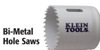
Bi-Metal Hole Saws