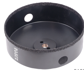
Carbide Grit Hole Saws