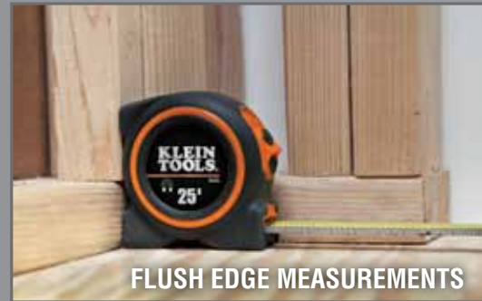
FLUSH EDGE MEASUREMENTS

For over 155 years, Klein Tools has set the standard that others measure up to! This new line of Tape Measures extends the Klein legacy of combining innovative features with Klein's quality, durability and comfort. With a Klein in your hand, you can be sure of quick, easy and accurate measurements, and a tape that will stand up to the measuring tasks at any job site.