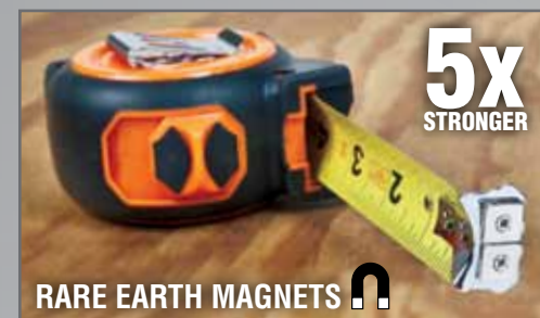
RARE EARTH MAGNETS