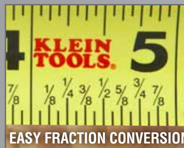
EASY FRACTION CONVERSION