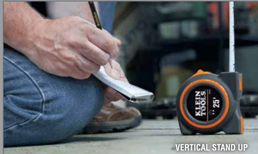
VERTICAL STAND UP