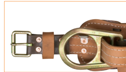
D-ring for 5299N

Forged circle D-rings have corrosion-resistant finish and are proof-loaded to meet OSHA regulations.