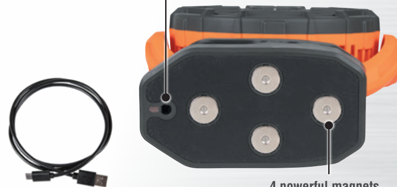
USB-C cable included