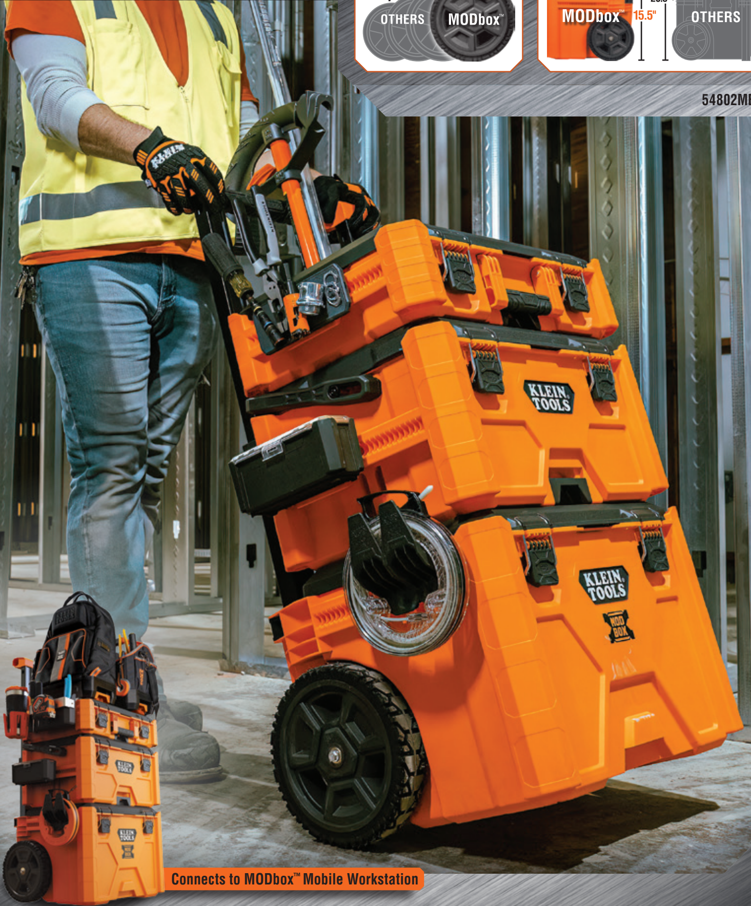
Connects to MODbox™ Mobile Workstation